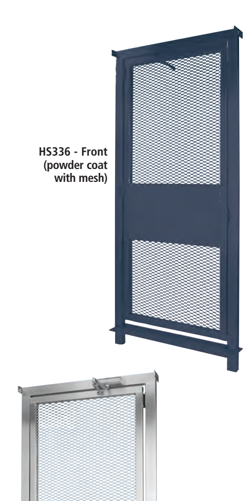
HS336 - Back (stainless steel with mesh)